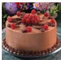
Chocolate Raspberry Mousse