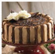
Tiramisu Available only as 8 inch multi-layer