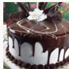
White Chocolate Marble Rum