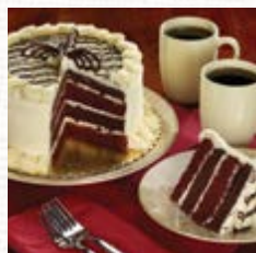
Red Chocolate Surprise