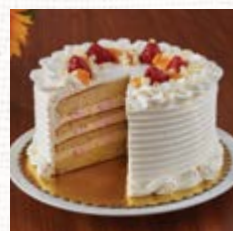
Mango Raspberry Mousse