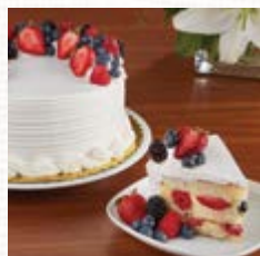
Berries 'n Cream

We can create a custom order with your choice of cake, filling, icing and personalize it for your special celebration.