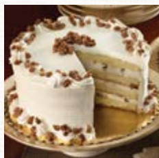
Salted Caramel Pecan Praline